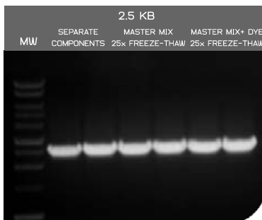
Figure 1: PCR amplification using EURx Color Opti Taq DNA Polymerase.

Storage Conditions: Store at -20°C for long-term storage (more than 12 months) or at 4°C for up to 2 months.