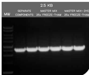
Figure 1: PCR amplification using EURx Perpetual Opti Taq DNA Polymerase.

Storage Conditions: Store at -20°C for long-term storage (more than 12 months) or at 4°C for up to 2 months.